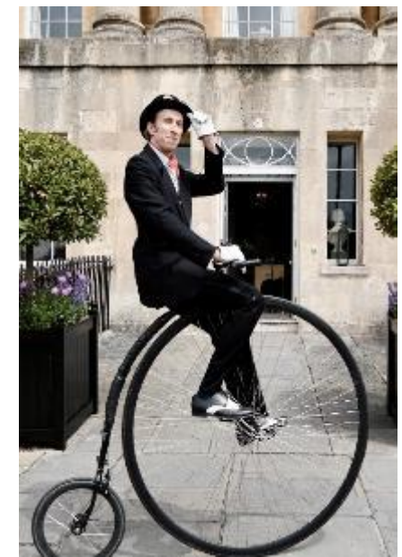
Penny farthing tours