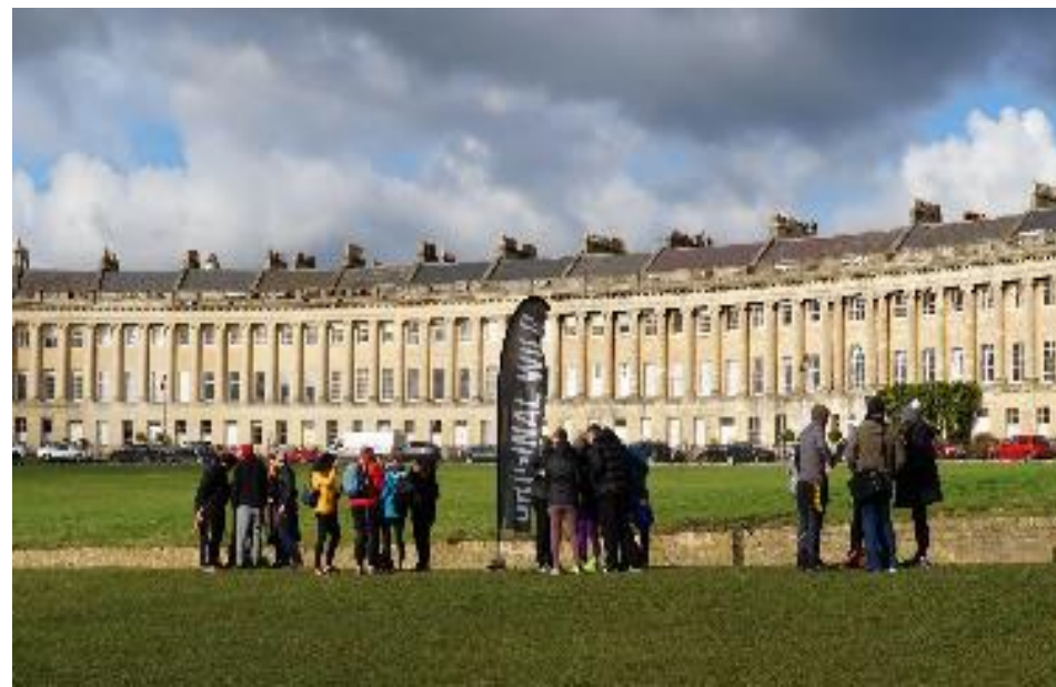
CODE Break - The ultimate skills focused challenge around Bath