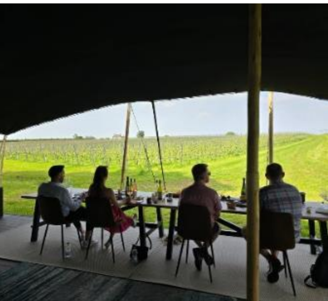
Vineyard experience with Bath's Minerva sparkling wine