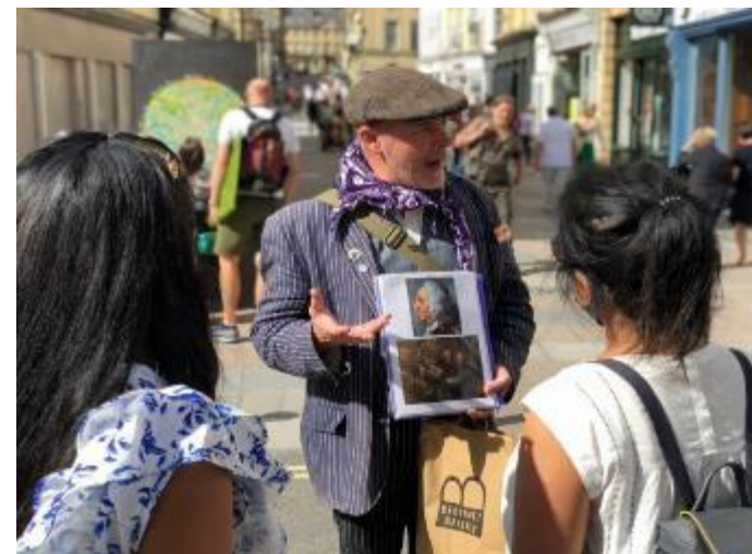
Savouring Bath – a gourmet tour of Bath