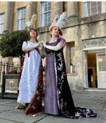
Jane Austen regency dancing