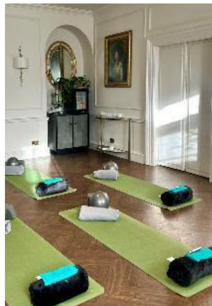
A wellness or mindfulness class