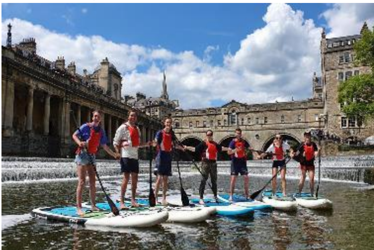
Paddle boarding or raft-making on the river Avon