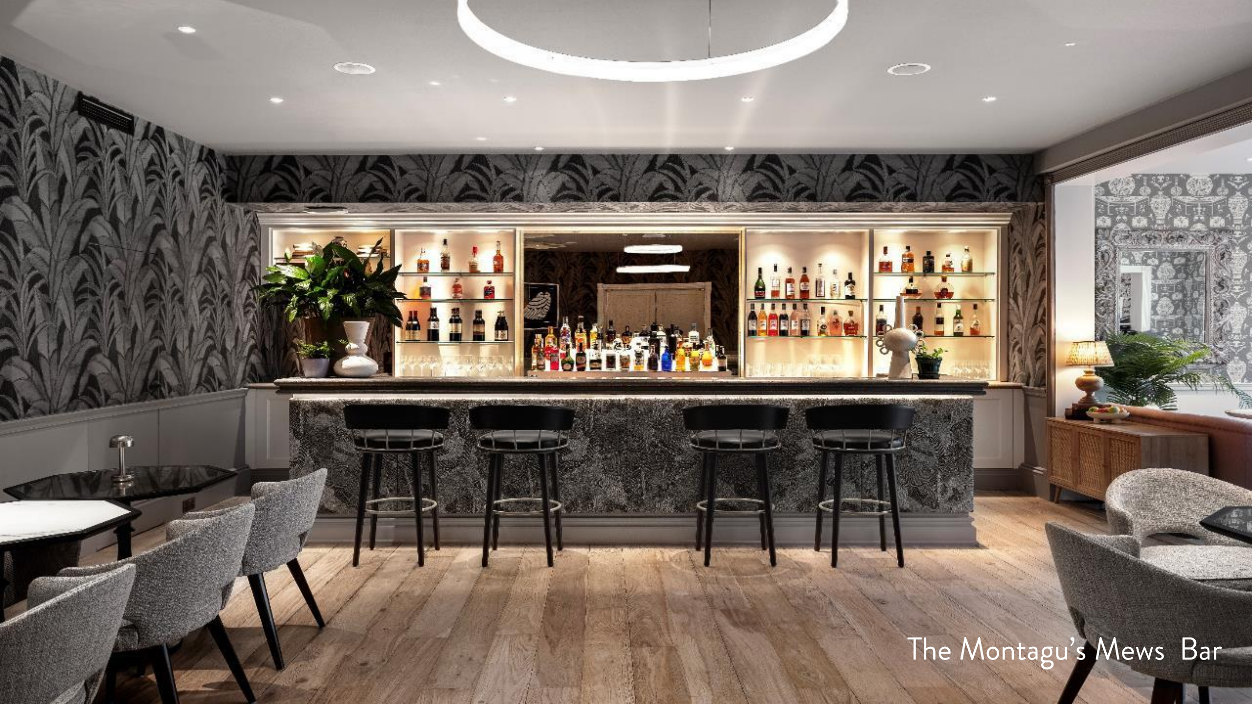
The Montagu's Mews Bar