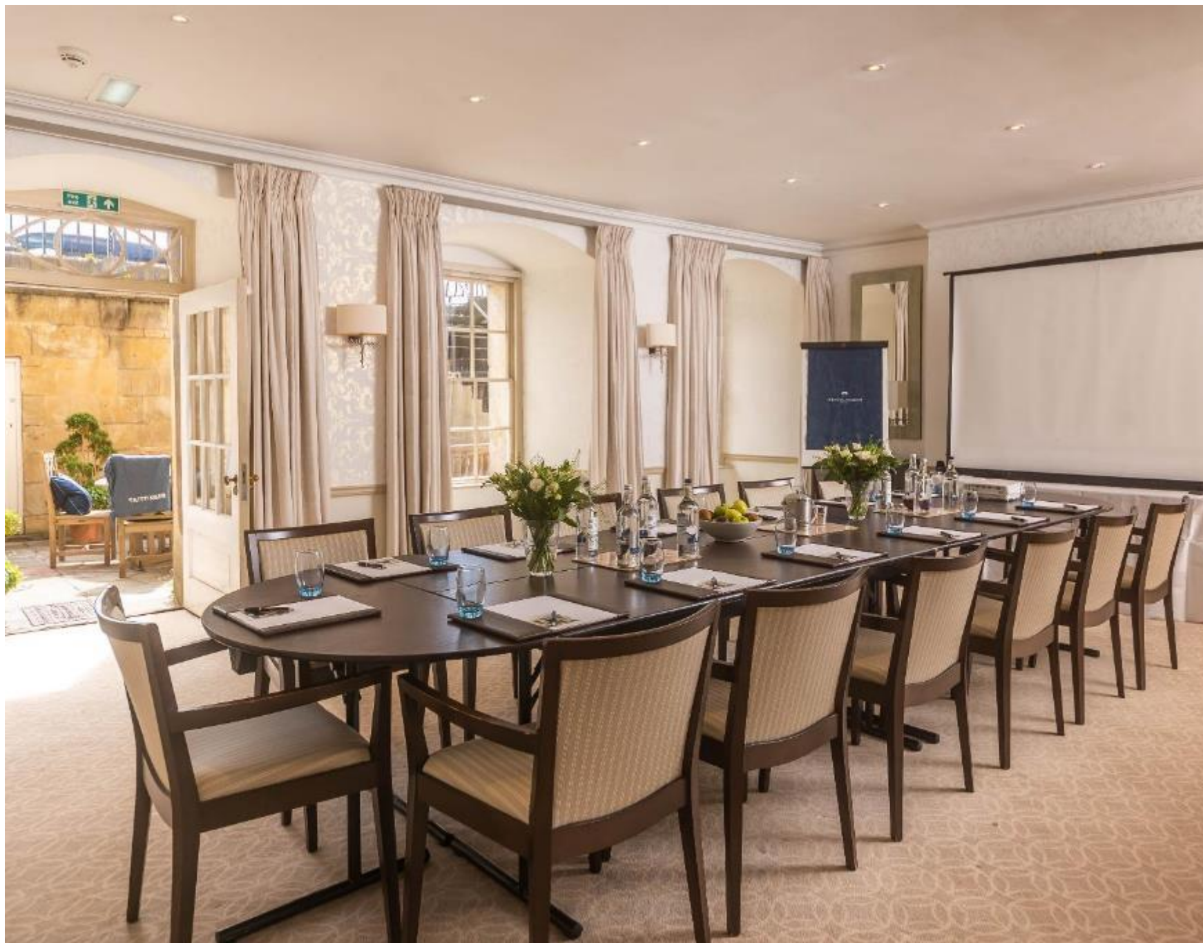
Meeting Space – The Sheridan Room with private courtyard