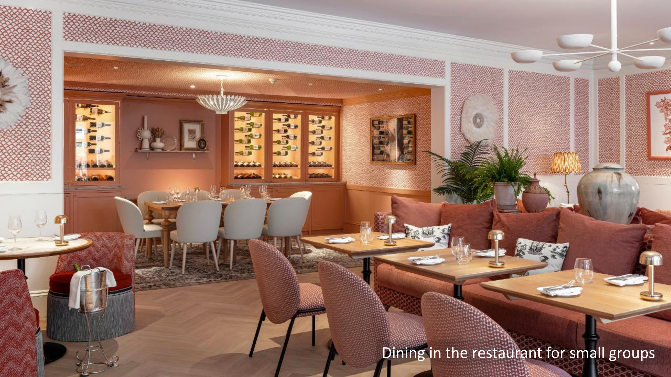
Dining in the restaurant for small groups