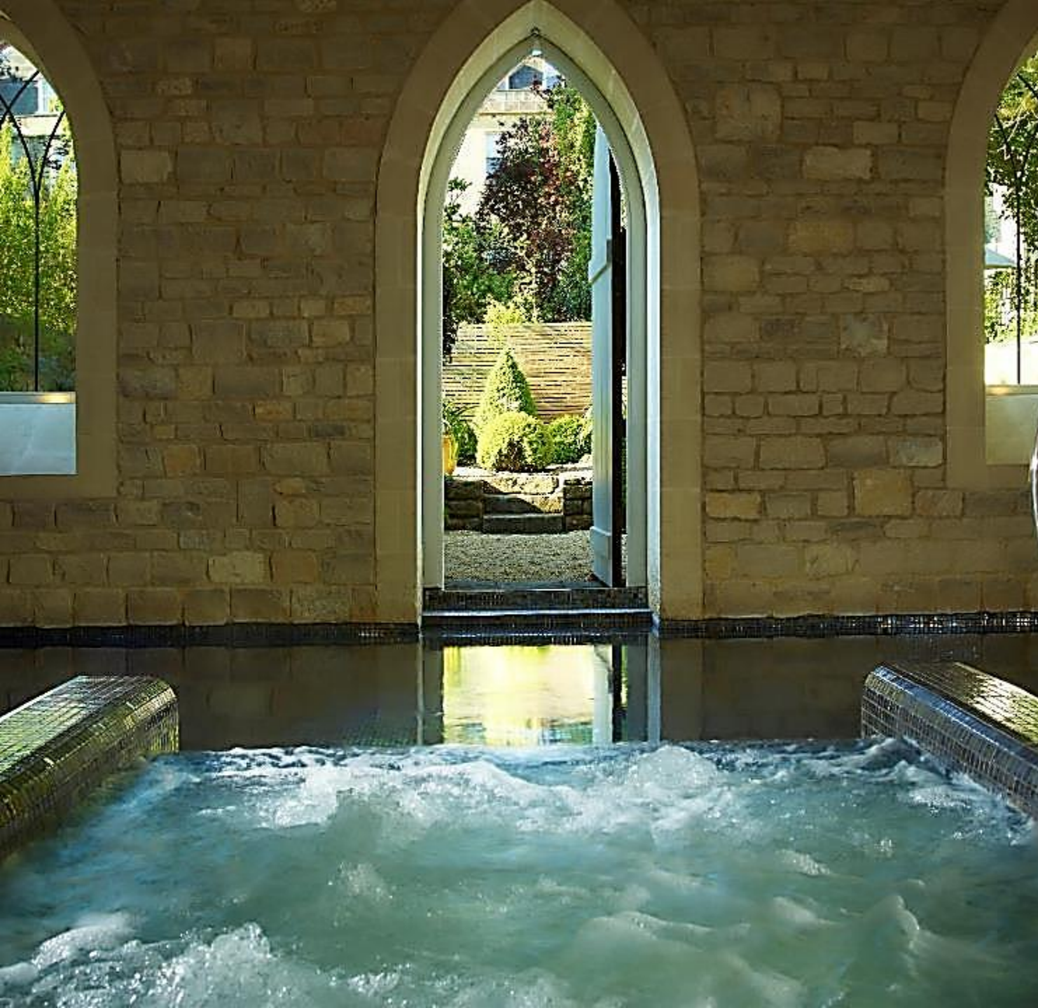
The Spa & Bath House